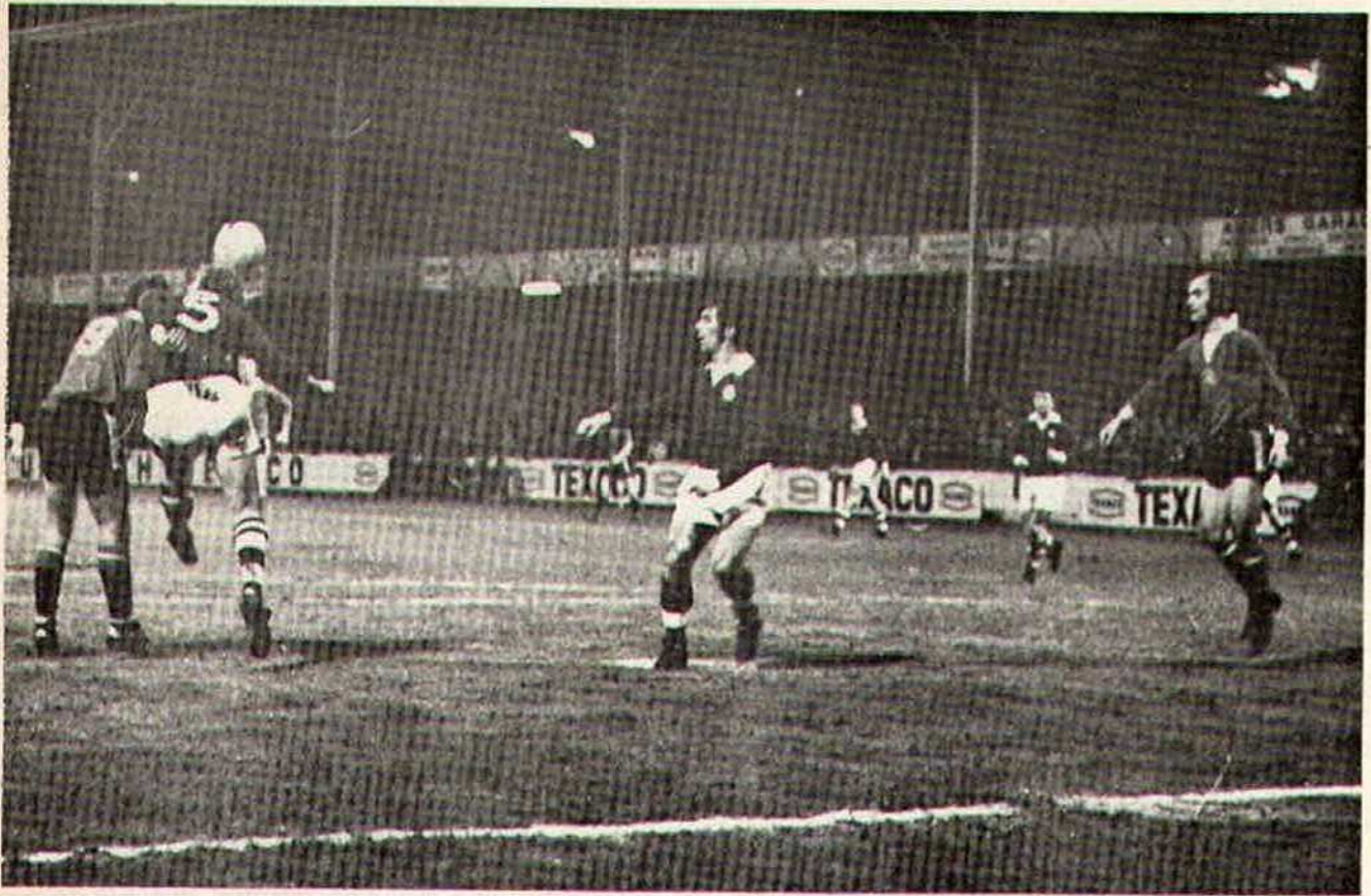
The Cardiff City centre-half clears his lines with a strong header during last Tuesday's match at the County Ground.